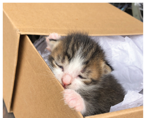
A kitten from one of Nala's litters.

While there's no single solution to the capacity crisis facing North Carolina shelters, real progress comes from addressing root causes from every angle – and our new Regional Campus marks the beginning of a new era in doing exactly that.