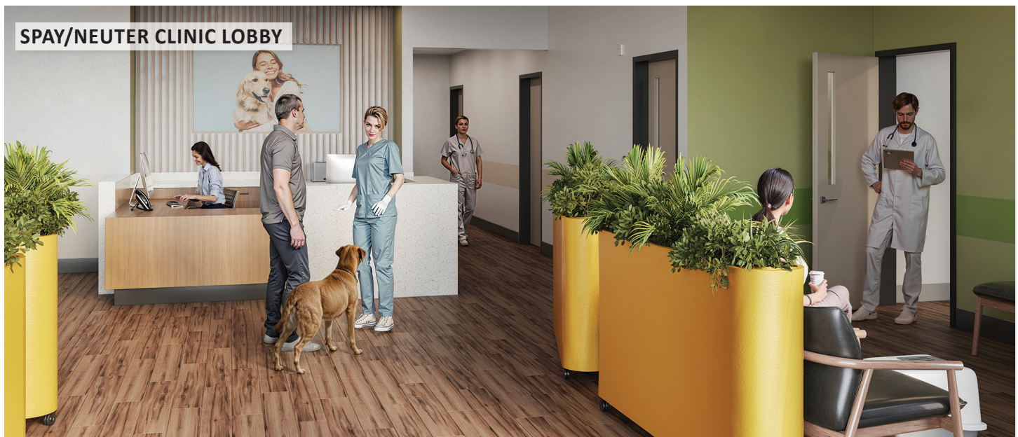
SPAY/NEUTER CLINIC LOBBY

The lobby, with separate areas for cats and dogs, was designed for the efficient check-in and discharge of 30 animals per day, five days a week.