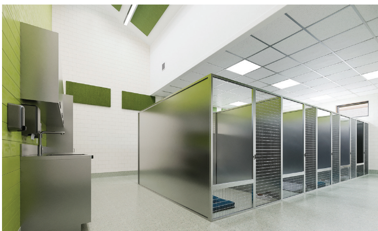
Above: Dog Loft with 5 Dog Kennels (Dog Housing Wing)