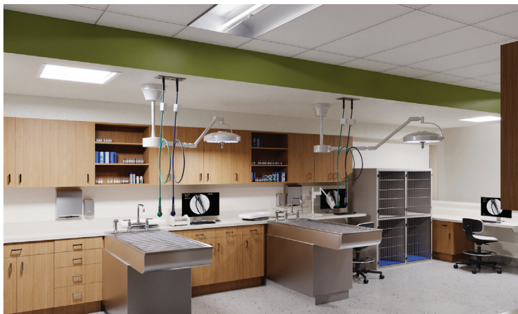
Above: Medical Treatment Area (Veterinary Medical Center)

We have many ways to give, including donations of appreciated securities and stocks, QCD gifts through IRAs, DAFs and more.