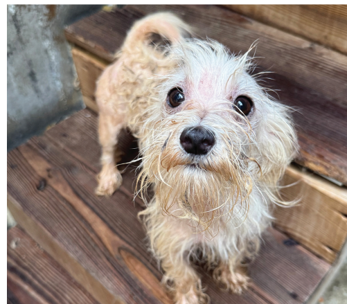
One of the 101 puppy mill survivors.

Every pet transferred into our care is a life redirected from an uncertain fate. And every new partnership brings North Carolina closer to a future where more animals make it out of shelters and into loving homes.