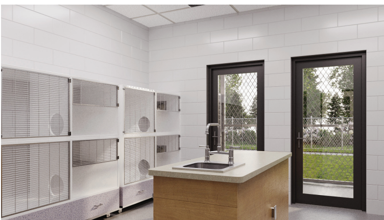
Above: Cat Loft with Condos and Catos (Cat Housing Wing)