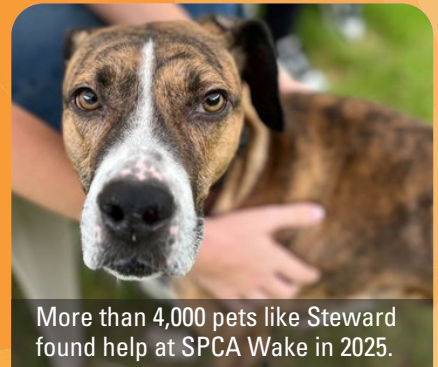
More than 4,000 pets like Steward found help at SPCA Wake in 2025.

As housing challenges and rising costs strain pet owners, the Pet Helpline is a vital lifeline for keeping pets with the people who love them. Pet Helpline staff collaborates with all SPCA departments to provide a solution or additional resources tailored for each case.