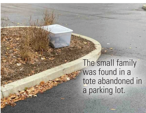
The small family was found in a tote abandoned in a parking lot.

Because of your support, SPCA Wake was able to place the whole family of cats into the same foster home, where they grew healthy and happy and found the permanent homes and loving families they deserved. Our team was able to give them a clean bill of health and had them all spayed/neutered as soon as they were old enough.