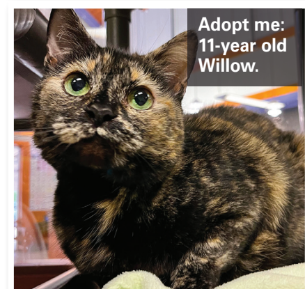
Adopt me: 11-year old Willow.