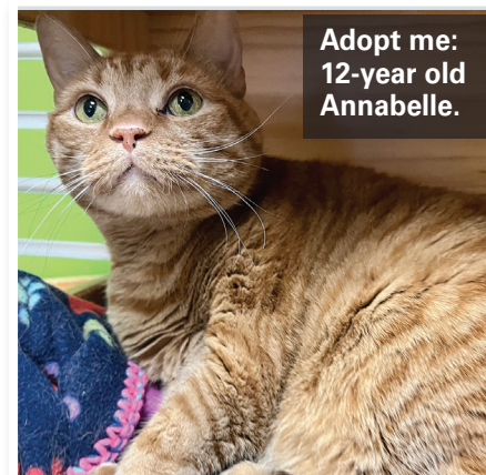
Adopt me: 12-year old Annabelle.