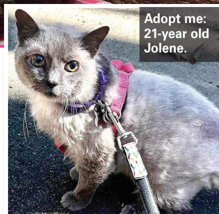
Adopt me: 21-year old Jolene.

These senior cats and others are available for adoption! If you’d like to meet one of our seniors, please visit spcawake.org/adopt .