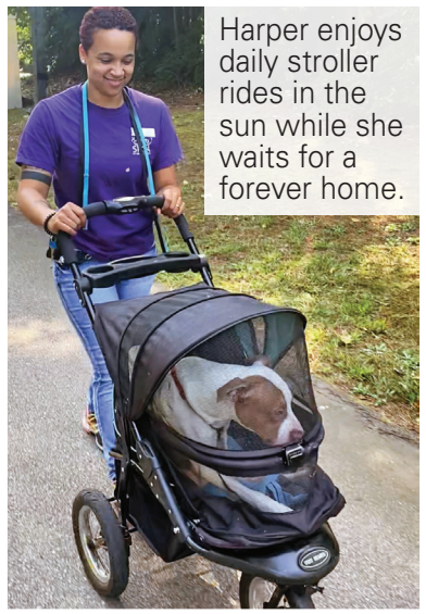
Harper enjoys daily stroller rides in the sun while she waits for a forever home.