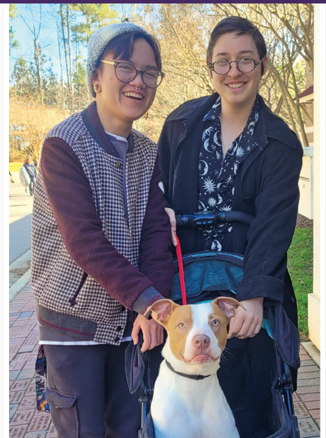
After 100 days in the shelter, Harper is wheeled out to meet her new family on adoption day.

Thank you for supporting SPCA Wake to ensure dogs like Harper have a place to go when they need help the most. Because of you, pets like Harper can find the care they need at SPCA Wake. Your support provides the individualized care, time, and love they need and paves the road to true fairytale endings. For Harper, her new mom, and all of us — you made a dream come true. ♦