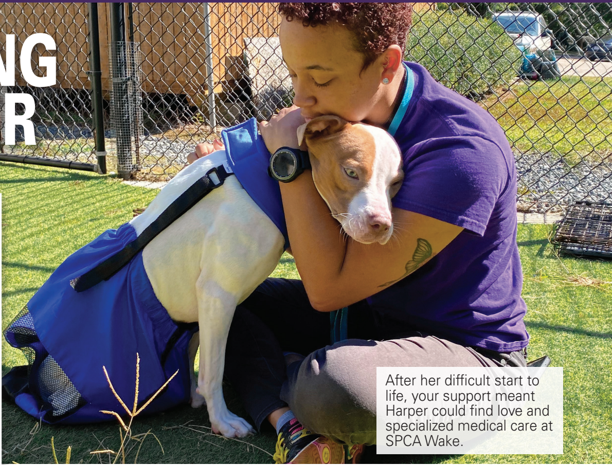
After her difficult start to life, your support meant Harper could find love and specialized medical care at SPCA Wake.

W hen Harper first came through our doors, we imagined what her new future might hold. With optimism held tightly in our hearts, we dreamt of a special family — one with the patience to look beyond Harper's occasional accidents knowing she couldn't help it, the generosity to accept more veterinary expenses than a typical dog would need, and the compassion to see Harper for her joy and spirit on the inside rather than her obvious disability on the outside.