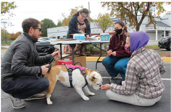
Our team speaks with a local pet owner about other SPCA Wake services, such as low-cost spay & neuter.

A microchip is a tiny device, smaller than a grain of rice, that is permanently implanted under a pet's scruff. This chip acts as a reliable form of identification that stays with the pet for the rest of his or her life.