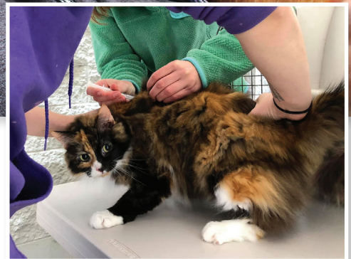
A microchip will help this cat find her way back home if she is ever lost.

Each and every pet at SPCA Wake is microchipped prior to adoption, but the cost of microchips is prohibitive to many other families. As a result, the majority of pets in our state go without this essential safety net , leaving them vulnerable to being separated from their owners. Not only is this heartbreaking to families who love their pets, but it further contributes to the cycle of pet homelessness and shelter crowding in our state that we continue to battle together.