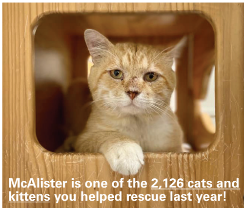
McAlister is one of the 2,126 cats and kittens you helped rescue last year!

Joy smiles big with her new brother Tater Tot, another SPCA Wake alum.