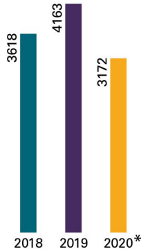
ADOPTIONS YEAR-TO-YEAR COMPARISON