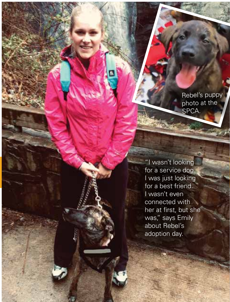
Rebel's puppy photo at the SPCA.