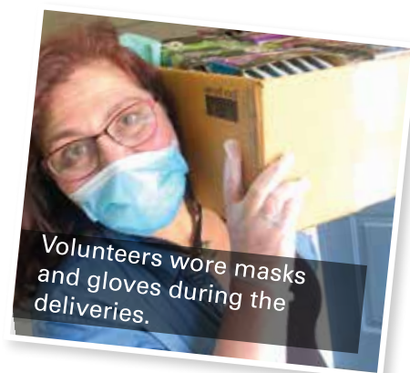
Volunteers wore masks and gloves during the deliveries.

"When you're on a fixed income, as a senior citizen, and have expensive