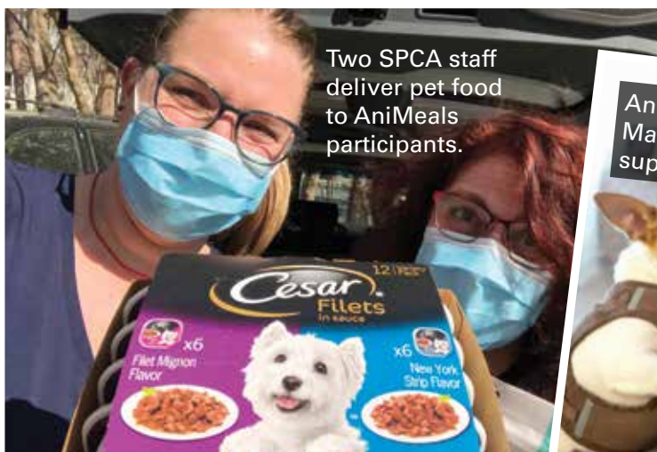
Two SPCA staff deliver pet food to AniMeals participants.

With no visitors allowed, pets help the homebound