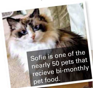
Sofie is one of the nearly 50 pets that receive bi-monthly pet food.

We couldn't have made this last-minute delivery without your support. You are the lifeline allowing these seniors and homebound adults to stay safe at home. Thank you!