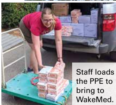
Staff loads the PPE to bring to WakeMed.

We know when the pandemic passes, the staff and volunteers at the SPCA will come back with vigor, energized, and most importantly healthy -- and ready to pick up where we left off. Thank you for standing by our side during this challenging time.