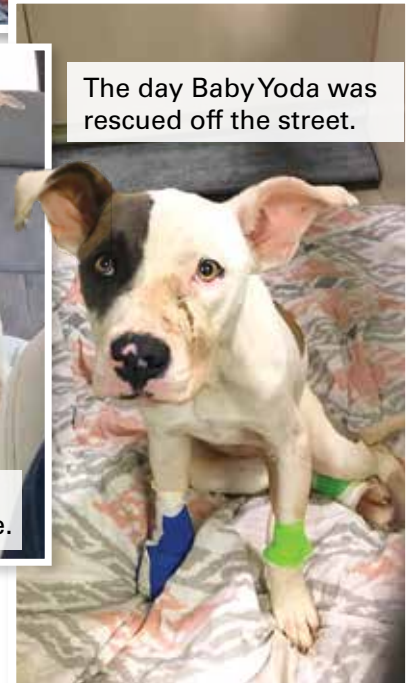
The day Baby Yoda was rescued off the street.