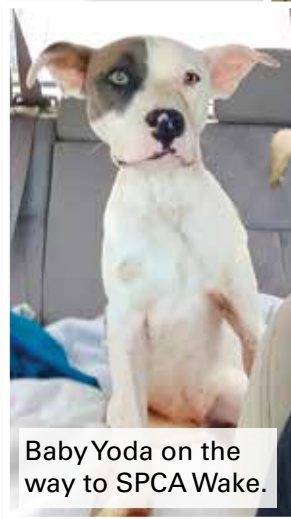
Baby Yoda on the way to SPCA Wake.