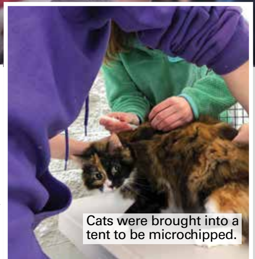
Cats were brought into a tent to be microchipped.

owners to pay what they could afford for a microchip (including lifetime registration), even if that amount was $0.