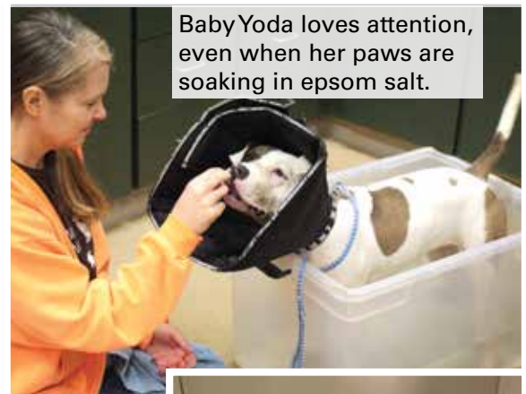
Baby Yoda loves attention, even when her paws are soaking in epsom salt.

The safety net program is especially helpful in eliminating euthanasia as the only option for injured pets at our shelter partners operating with limited resources.