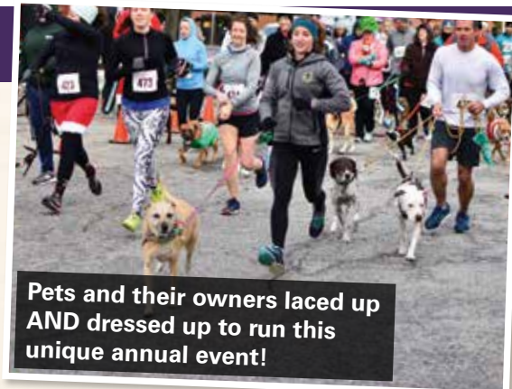
Pets and their owners laced up AND dressed up to run this unique annual event!

Visit spcawake.org/5K for details and our 2020 race date: 11-5-20