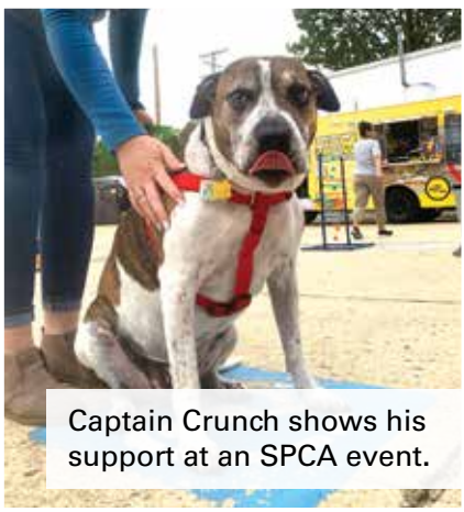
Captain Crunch shows his support at an SPCA event.

Your support of SPCA Wake saves thousands of our community's dogs and cats each year. Placed with loving families, these pets give back in profound ways to the people who opened their homes and hearts to give love to a shelter pet.