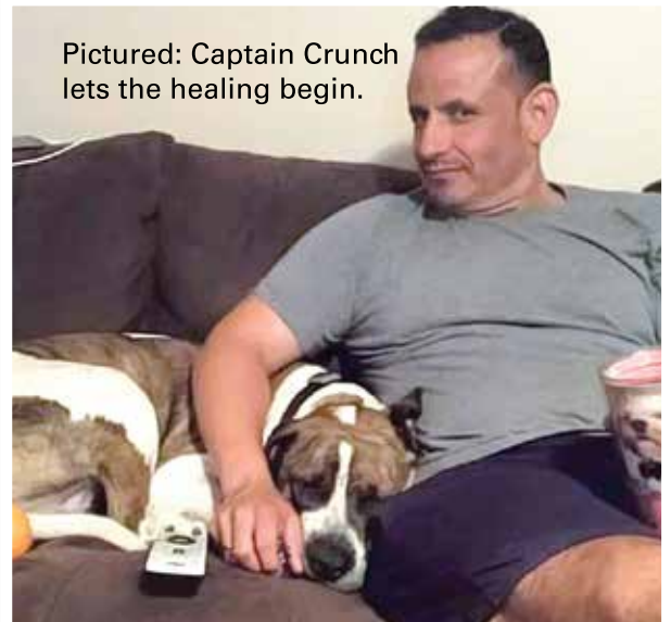
Pictured: Captain Crunch lets the healing begin.